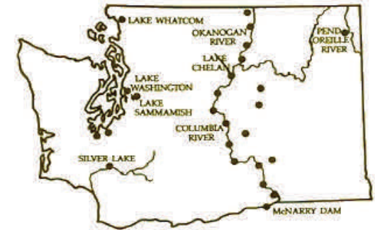
Areas of major milfoil infestation

Washington is under siege and we need your help to keep it clean of further Water Milfoil infestation.